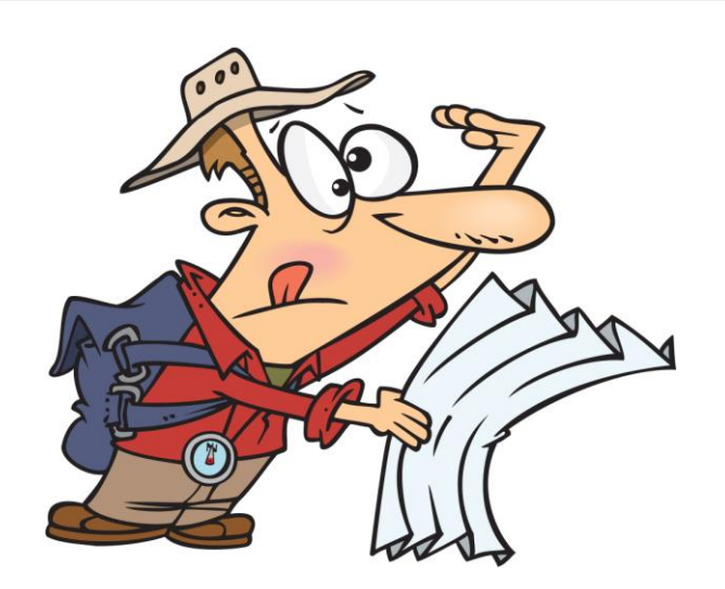
I have my map.