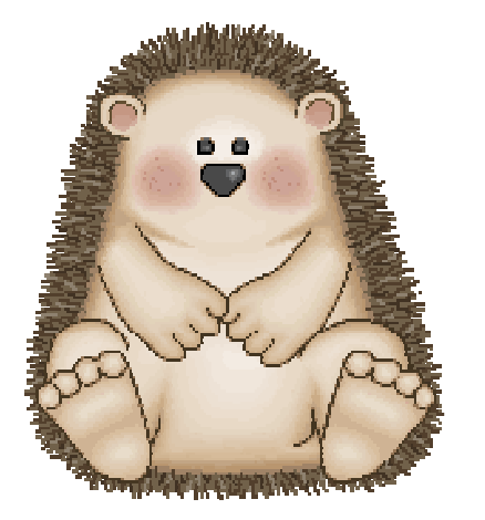
That's what I see!