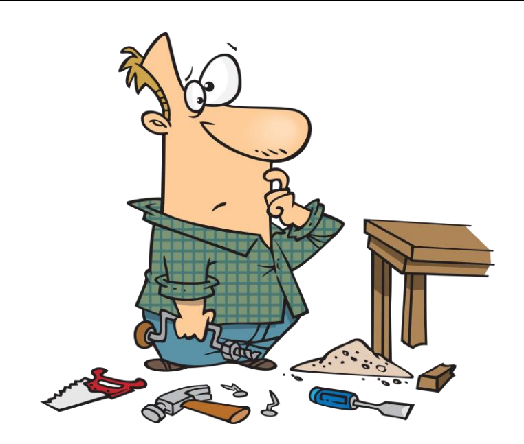
but they need to know how to use the tools!