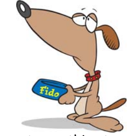
I want something to eat.