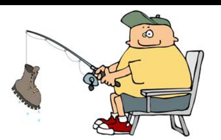
Still no fish for me.