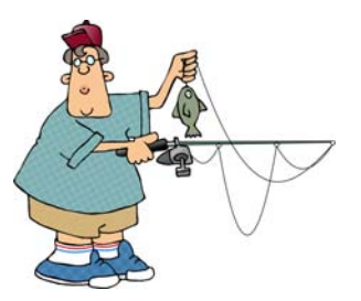
I can catch a fish!