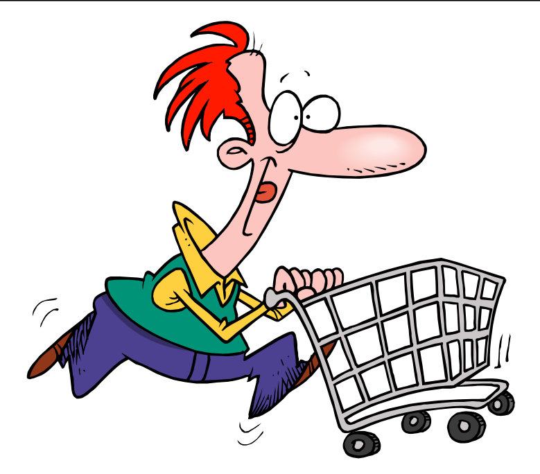
My dad can take off and move kind of fast for a change.