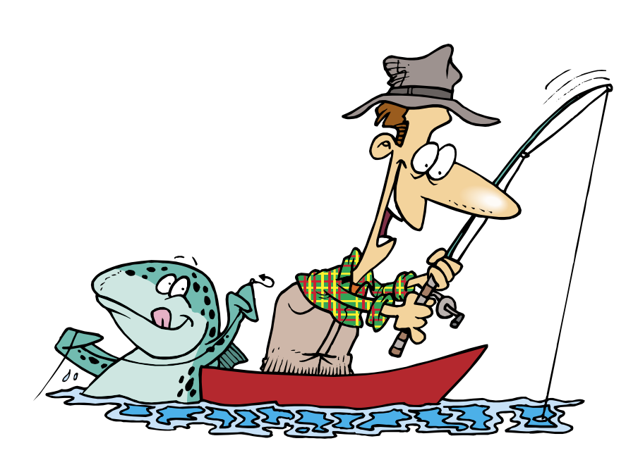
We like to go fishing, too!