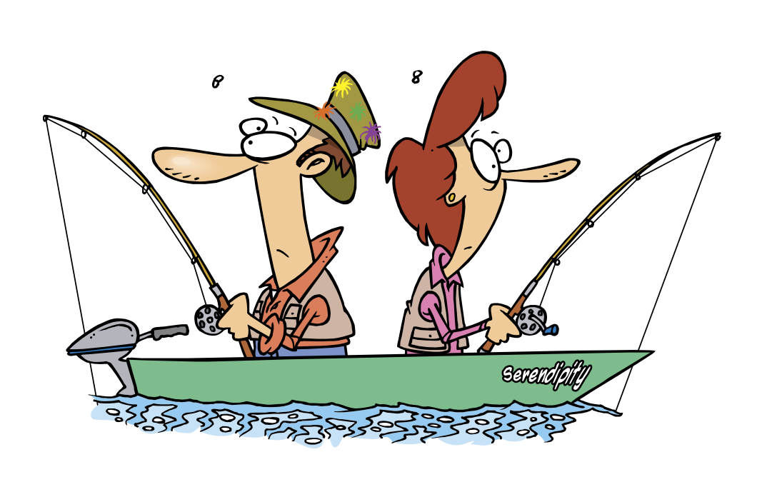
We like to go fishing.