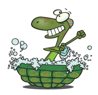
-ub Pictures and Words